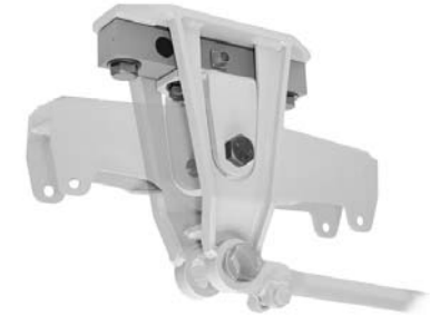
H32 CENTER HANGER MOUNTING KIT WITH 15" SUPER-BEAM™ SIDE CONNECTOR LOAD CELL