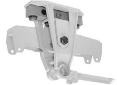
H32 CENTER HANGER MOUNTING KIT WITH 15" SUPER-BEAM™ SIDE CONNECTOR LOAD CELL